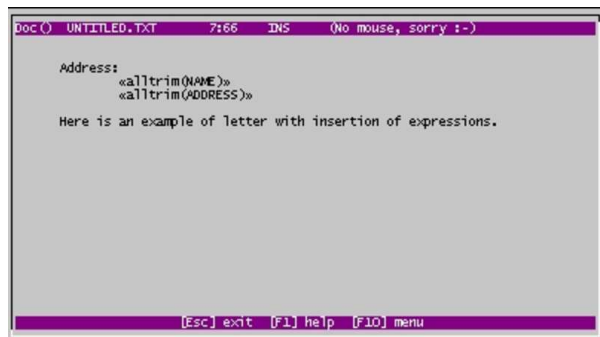
Figure u136.5. The integrated text editor.

nanoBase contains an integrated text editor not particularly good, but very useful for RPT files (as the expression insertion is very easy with the use of the [F2] key) and whenever there isn't any other editor there.