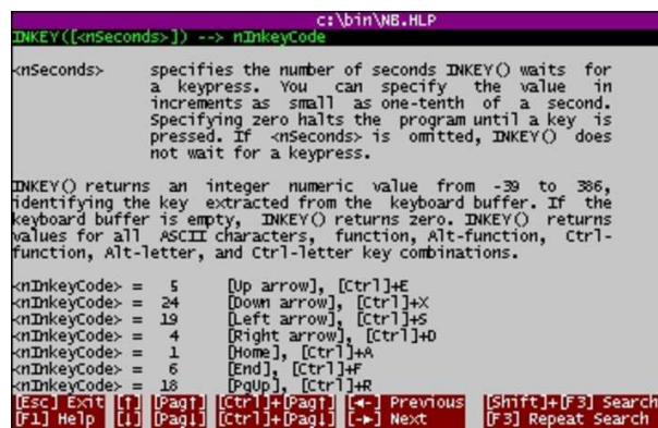
Figure u136.6. The internal documentation.

nanoBase's documentation is translated also inside the HTF format: 'NB.HLP' . Pressing [F1] , normally, a contextual piece of the manual appears.