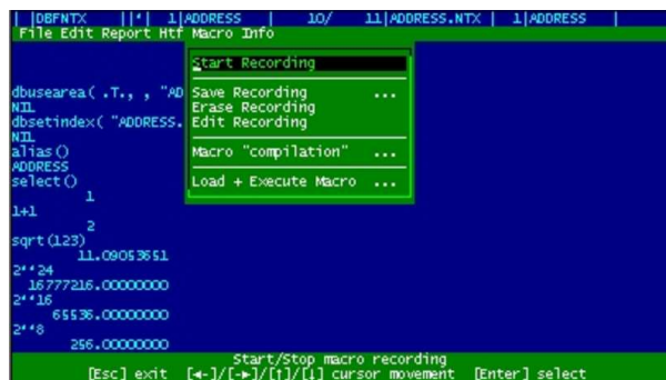
Figure u136.3. The macro menu.

nanoBase is able to record some actions made with the menu and all what is correctly typed from the dot prompt. This may be the begin for a little program (called macro inside nanoBase) that can be executed as it is (ASCII), or compiled into another format, faster to execute.